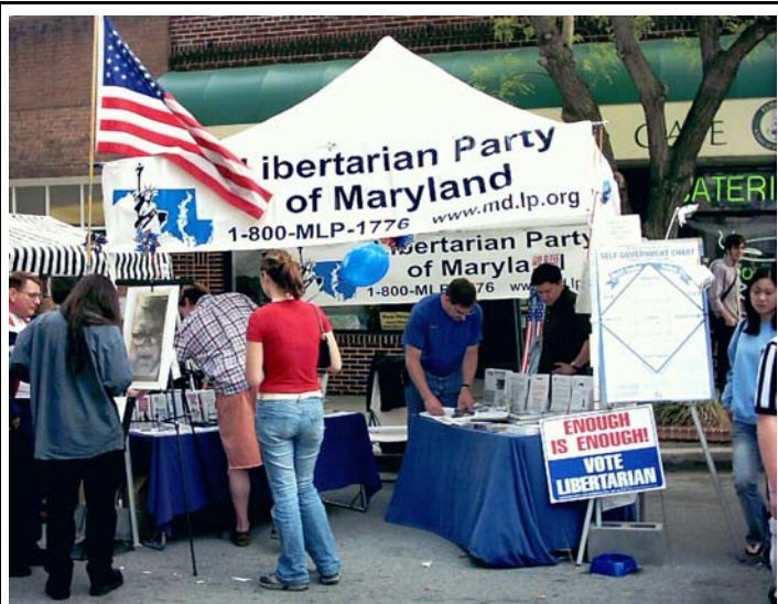
The MdLP booth at the Towson Towne Festival, the first fair of the season, on May 3/4

The students participating in the 28 th annual Business Today International Conference were surveyed about their feelings on corporate responsibility, government regulation of business, and corporate ethics. The question was, "To whom does a company have a responsibility?"