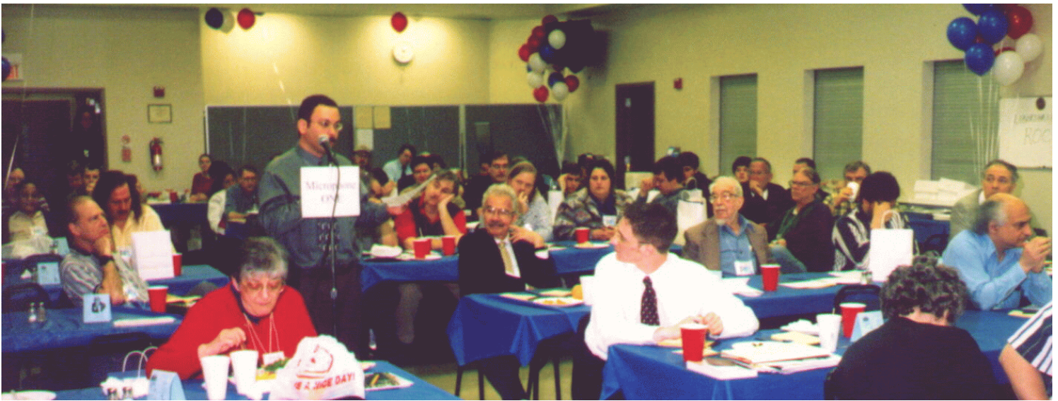
from page 1, 2003 MdLP Annual Convention

Know your audience. You can sometimes do a little political cross-dressing. Learn more about Myers-Briggs personality types; find out that people think and make decisions in different ways. One of the two choices is Intuitive vs. Sensory in ways of gathering information. Sensory types gather information for their senses, and are non-abstract, concrete thinkers. About 70% of people are sensory types, and don't care too much about abstract concepts; but they will get specific concrete examples. Libertarianism appeals to all four temperament types, although most libertarians are abstract thinkers. Learn why people may be attracted to libertarianism. Know what the issues are, and what questions you're going to be asked. Learn and practice short answers: have a 30-second answer ready, and say you don't know if you don't. Take "yes" for an answer. Don't pounce on the one thing they disagree with you on. Also take "no" for an answer; some people are not going to be libertarians today, next week, or ever. Fish at least where there's water . Use pictures, like the Nolan chart. The Advocates are working on a pamphlet providing explanations of the libertarian answers to the Nolan chart questions.