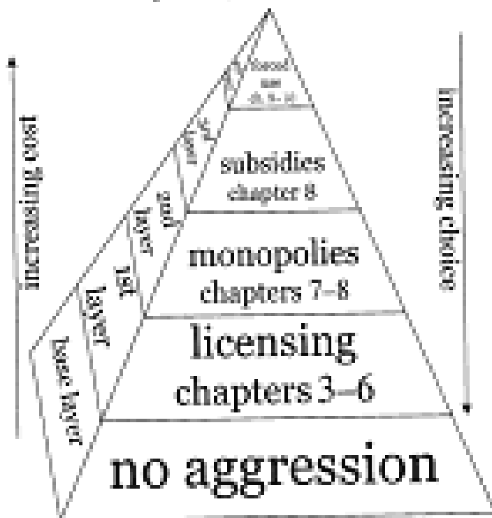
Figure 1.1: Pyramid of Power